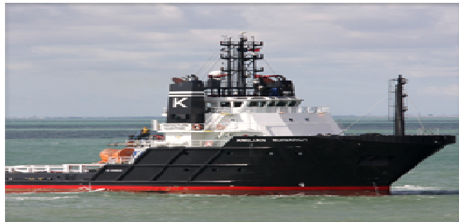
"Anglian Monarch" – Support Vessel For Stanislav Yudin