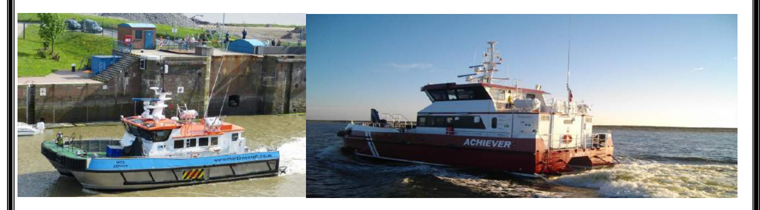
Transporter (CTV/Support vessel)