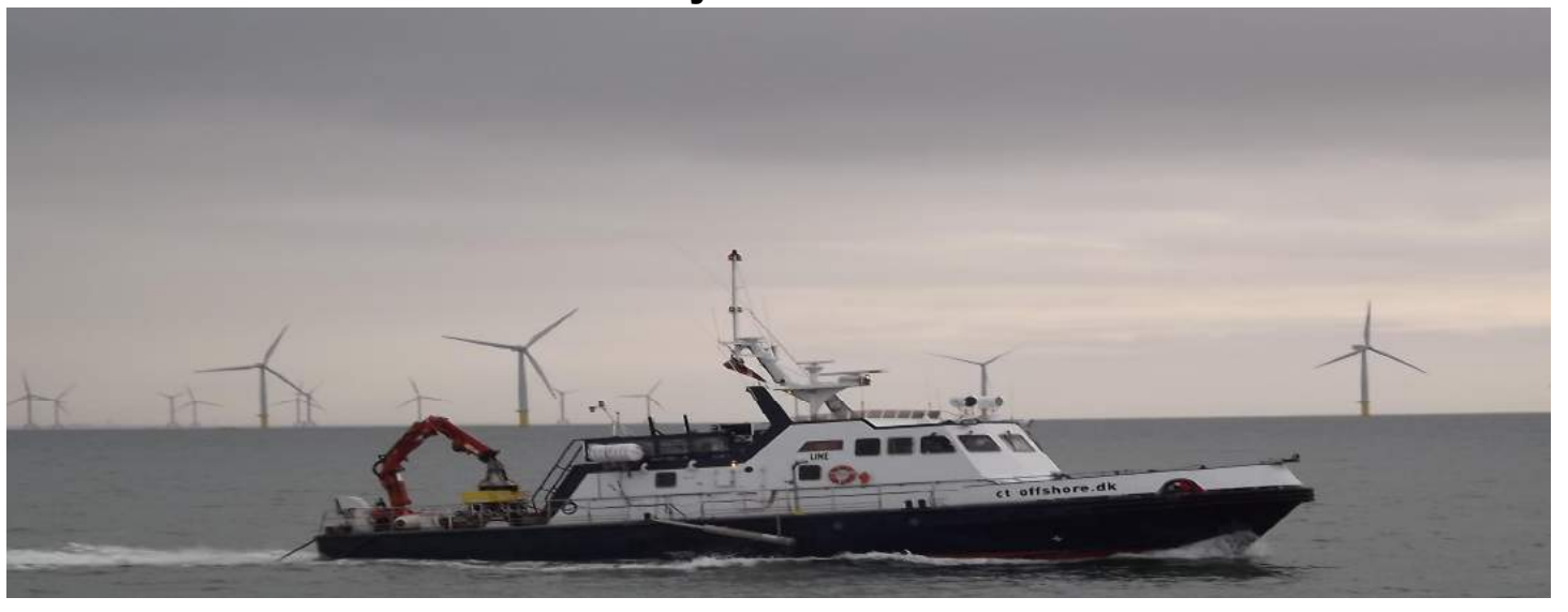
MCS Zephyr (CTV / Support vessel)