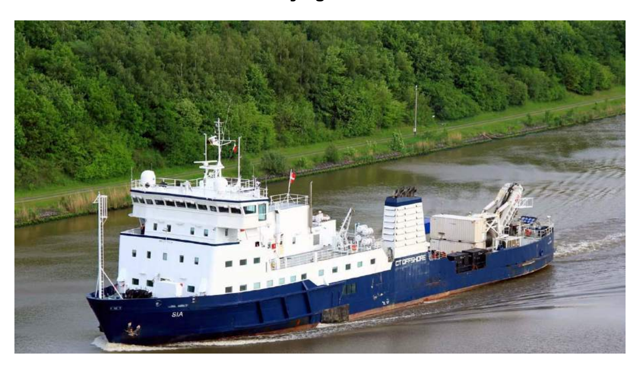
Cable laying vessel SIA