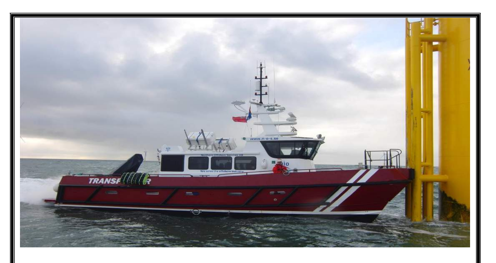
Gwynt y Mor offshore wind farm