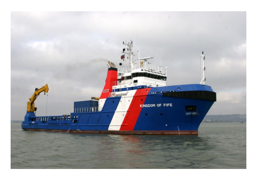
Photograph 2 - Tug KINGDOM OF FIFE

Offshore: From the 15 metre contour off Ardneil Bay to the 15 metre contour off Port a' Mhiadair, the grapnel runs will be conducted by Offshore Tug KINGDOM OF FIFE, see photograph 2, which will be towing a grapnel underwater along the seabed and will be Restricted in its Ability to Manoeuvre .