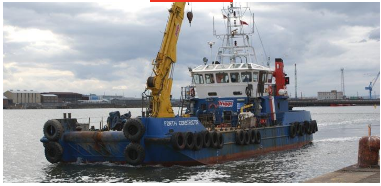
Photograph 1 – FORTH CONSTRUCTOR

Briggs Marine Divers will conduct the installation of the Mattresses from the shoreline to the 15 metre contour depth. These operations will take place day and night, commencing on or about Saturday 9<sup>th</sup> May 2015. The vessel will be displaying appropriate shapes, lights and flags for their operations and all vessels are to maintain a safe distance and operate at reduced speed with due regard to the effects of wash.