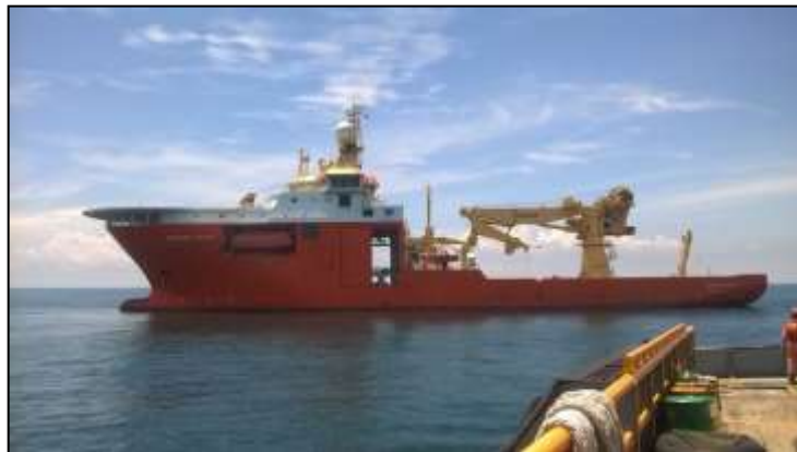
PLIB Support vessel - Normand Pacific

The vessels will monitor VHF Channel 16 at all times.