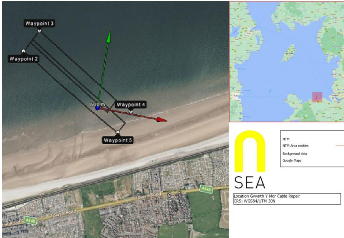
Figure 1 – Gwynt Y Mor Project Area

Please be advised of this notice advising mariners of the pre-construction survey of the Gwynt Y Mor export cable corridor. The Titan Discovery will carry out the survey work. The work will start some time from the 23 rd of May 2024 with the works scheduled to last up to 5 days subject to weather.